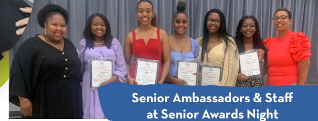
Senior Ambassadors & Staff at Senior Awards Night

Working as a Coalition in Union Parish to develop and implement a five year plan to address underage drinking, and prescription drug abuse while helping teens make proud choices. U-ACT is proud to partner with several entities in Union Parish.