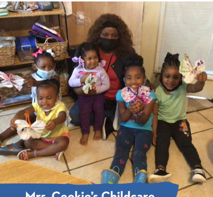
Mrs. Cookie's Childcare

Helping parents connect with quality child care, providing training and coaching to childcare teachers and leaders region wide (11 parishes).