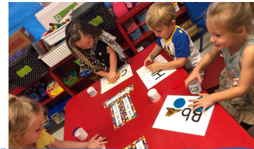
Downsville Community Charter School