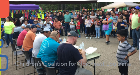
Children's Coalition for Northeast Louisiana

Celebrating Hispanic culture and heritage in Union and Ouachita Parishes as well as community resources for all ages.